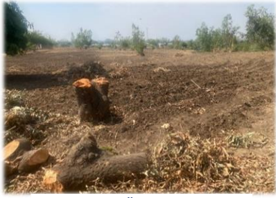
Land for 10 th Church Plant