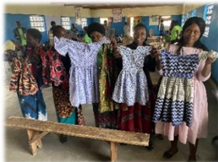
Ladies are doing a great sewing job!