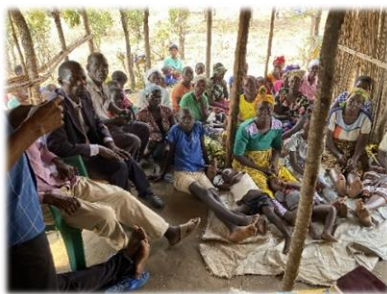
Preaching at another Church