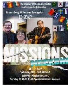
The Chapel of the Living Water Cornerstone Tent Meetings

I have preached on Heaven and Hell man Spoke of the woman at the well man There's a real deep need to tell man That's why I've been everywhere