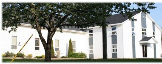
Faith Bible Baptist Fellowship