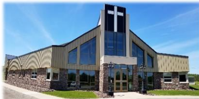
Hillsborough Baptist Church