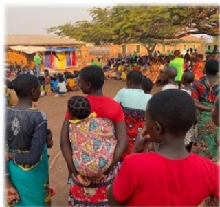
Crowd gathering for message