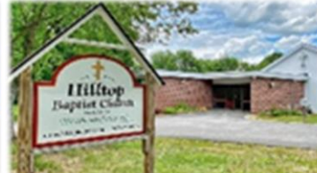
Hilltop Baptist Church