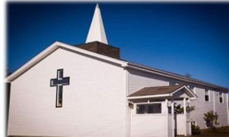
Port Hawkesbury Baptist