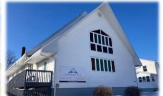
Calvary Baptist Church