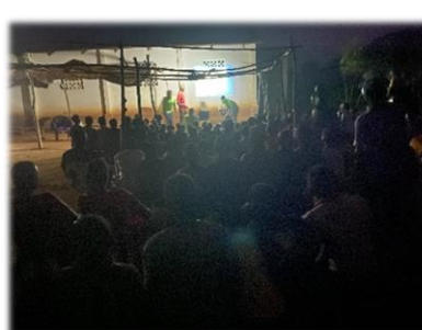
The Jesus Video on the outside wall