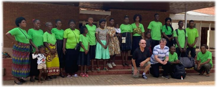
Those who came to see us off at the Airport