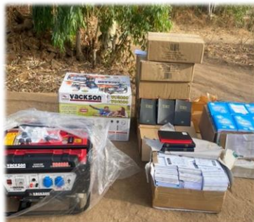
Supplies for Outreach Site