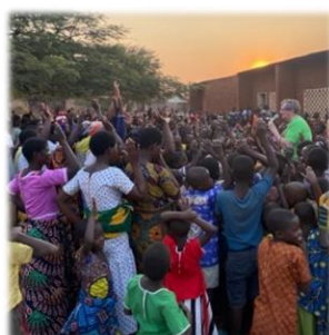
Hundreds respond to Christ