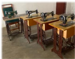
We provided 4 more Sewing Machines