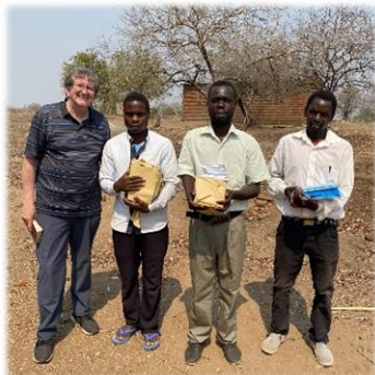
Pastors & Wives receiving Bibles