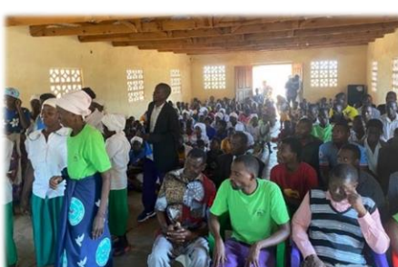
Another great crowd