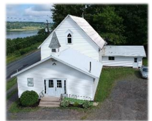
Upper Brighton Baptist Church