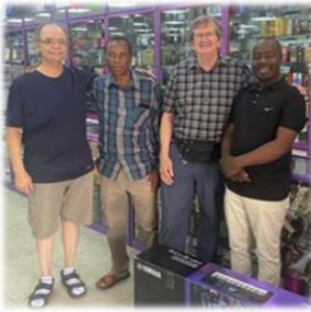
New Keyboard for Worship