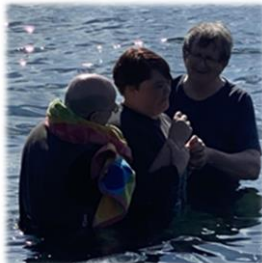
Campobello Beacon of Hope Baptism