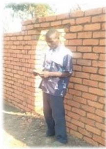
Saved Reading Tract