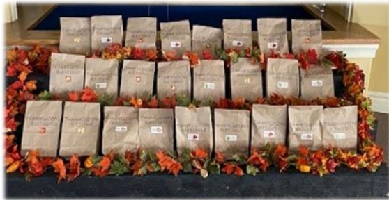
Door-to-door with Gifts