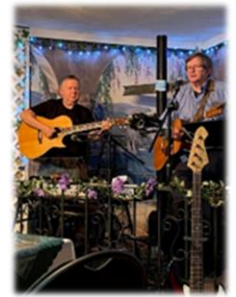
Light Spot Concert