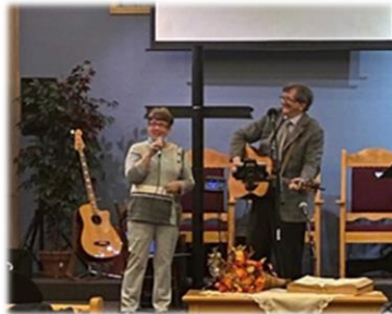
Concert at Calvary Baptist