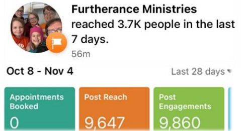
Facebook Posts Report