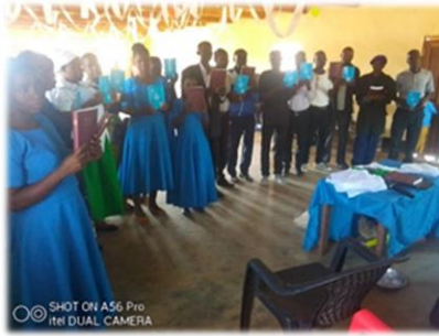
New Bibles and Hymn Books