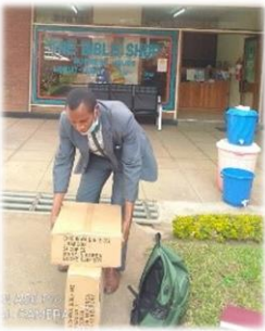
Pastor Receives Bibles